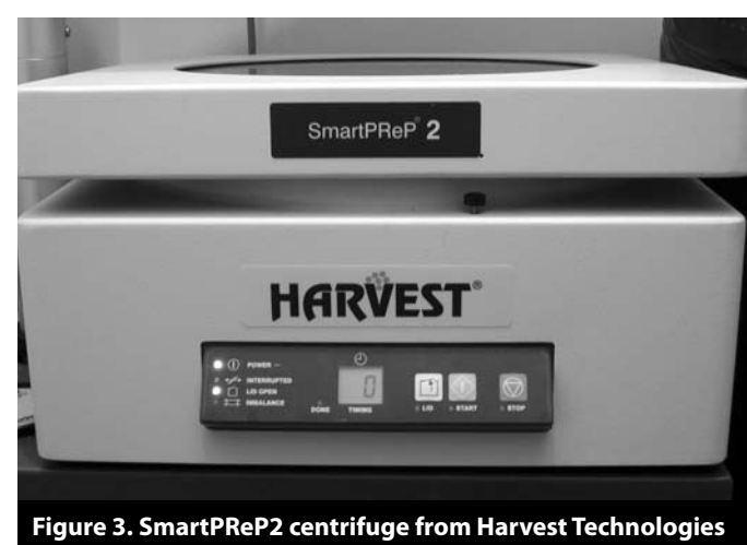
Figure 3. SmartPReP2 centrifuge from Harvest Technologies where the patient's blood is centrifuged to extract platelet rich plasma to be used for Prolotherapy injections.