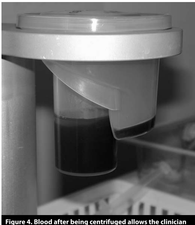
rigure 4. Blood after being centrifuged allows the clinician to extract the platelet rich plasma to be used for injection.

baseline as an acceptable standard.<sup>56</sup> Haynesworth et al.<sup>57</sup> demonstrated that the proliferation of adult mesenchymal stem cells and their differentiation were directly related to the platelet concentration, particularly showing a dose-response curve, which indicated that an adequate cellular response to platelet concentrations first began when a four to five fold increase over baseline platelet numbers was achieved.